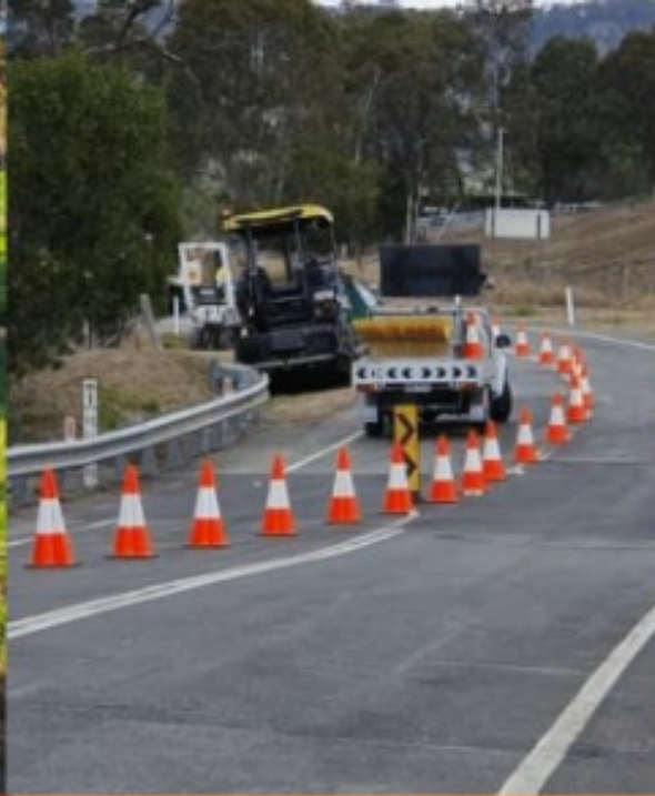
CLOSE SPACED CONES